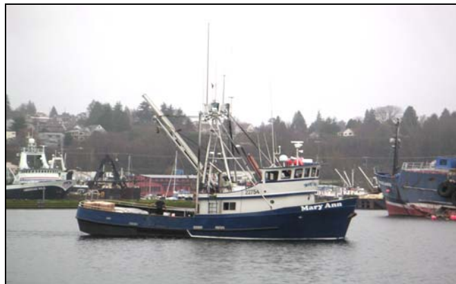
GFO Shaft Packing on F/V MARY ANN

The Solution: Change to INDUSTRIAL Brand™ GFO PTFE/Graphite tapered packing rated to 550 °F.