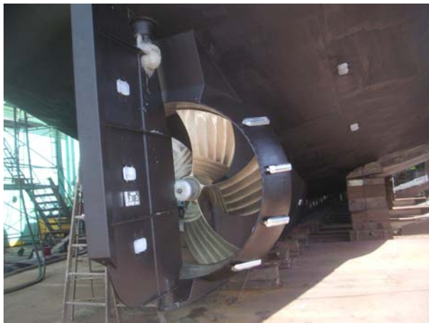
New Kruger/Rice Speed Nozzle and Propeller