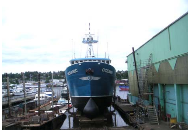
New Double Bottom Transverse Bulkhead