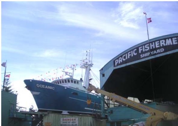
All Dressed Up for the Syttende Mai Parade