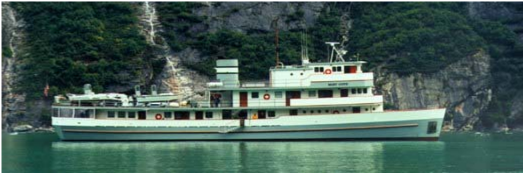
M/V MIST COVE

Seattle's Pacific Fishermen, Inc. shipyard has formed a marketing alliance with IWTNA International Water Treatment of North America for sales and installation of ELYSATOR water treatment without chemicals. The ELYSATOR water treatment equipment solves the age old problem of removing harmful corrosion causing impurities in fresh water systems without the use of chemical additives. First application by Pacific Fishermen, Inc. shipyard of the environmentally correct ELYSATOR was dual model 10 units onboard The Boat Company's passenger excursion yacht M/V MIST COVE for the vessel's twin Cleveland diesel engines and refrigeration cooling circuits.